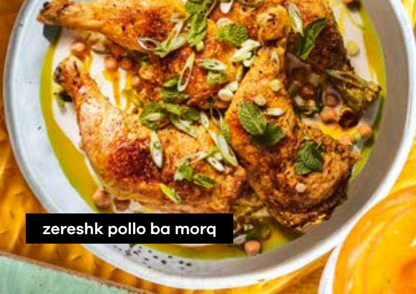
zereshk pollo ba morq